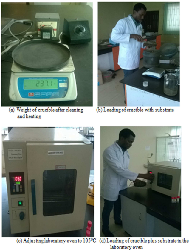
Figure 1. Experimental setup for determination of percentage total solid.