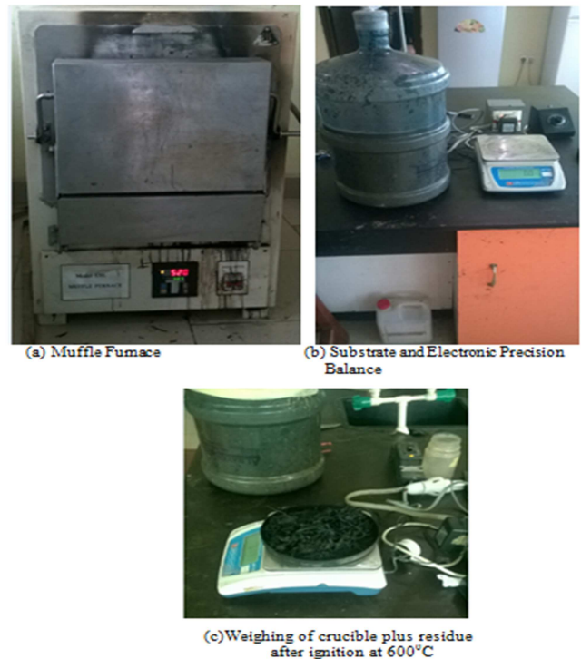
Figure 2. Experimental setup for determination of percentage volatile solid.

Figure 2 shows the experimental setup for determination of percentage total solid.